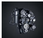
1.2L MPI Petrol Engine