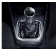
5-speed Manual Transmission