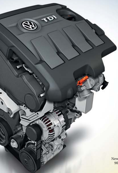
New 1.5L TDI Engine 90PS (66kW) Power 230 Nm Torque