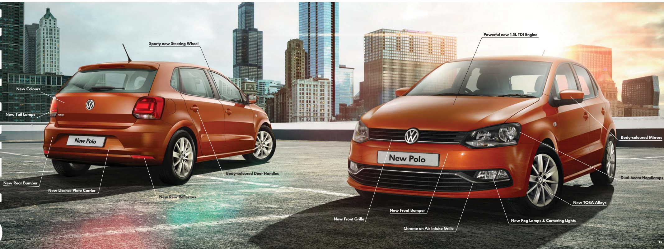
Sporty new Steering Wheel